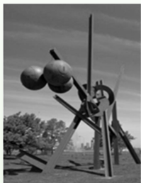
Storm King Art Center